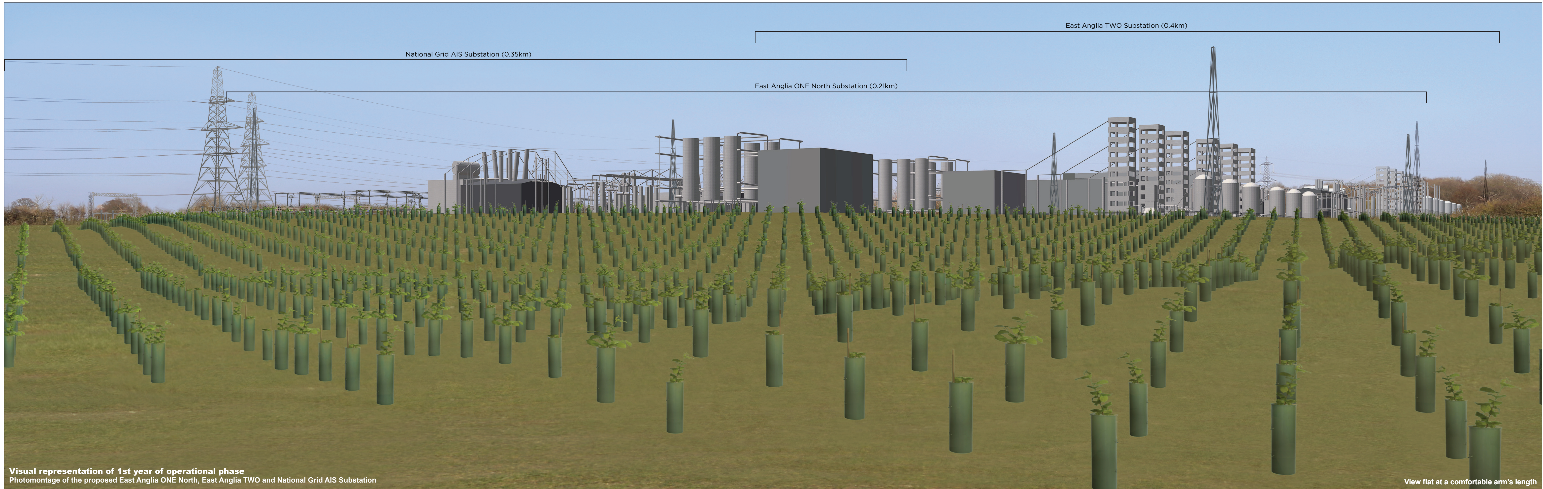
Visual representation of 1st year of operational phase Photomontage of the proposed East Anglia ONE North, East Anglia TWO and National Grid AIS Substation